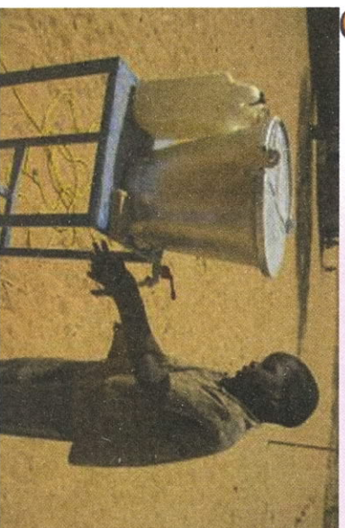
Washing hands has become a common practice among children in school