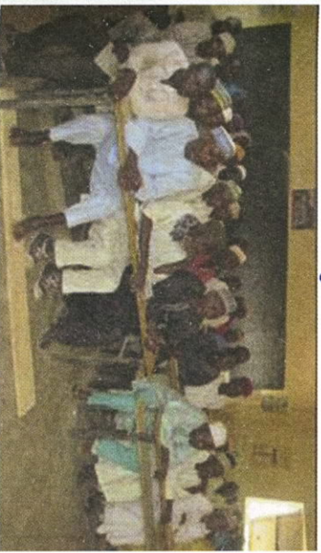
Community members learn about hygiene and good sanitation practices.